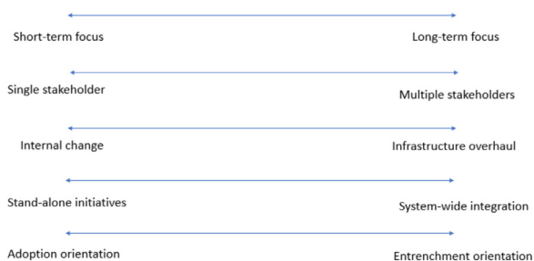
Fig. 3. Impediments to scaling up sustainable supply chain management.